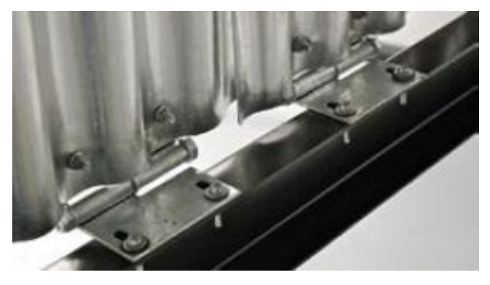
Self-Drilling Screw Fixed