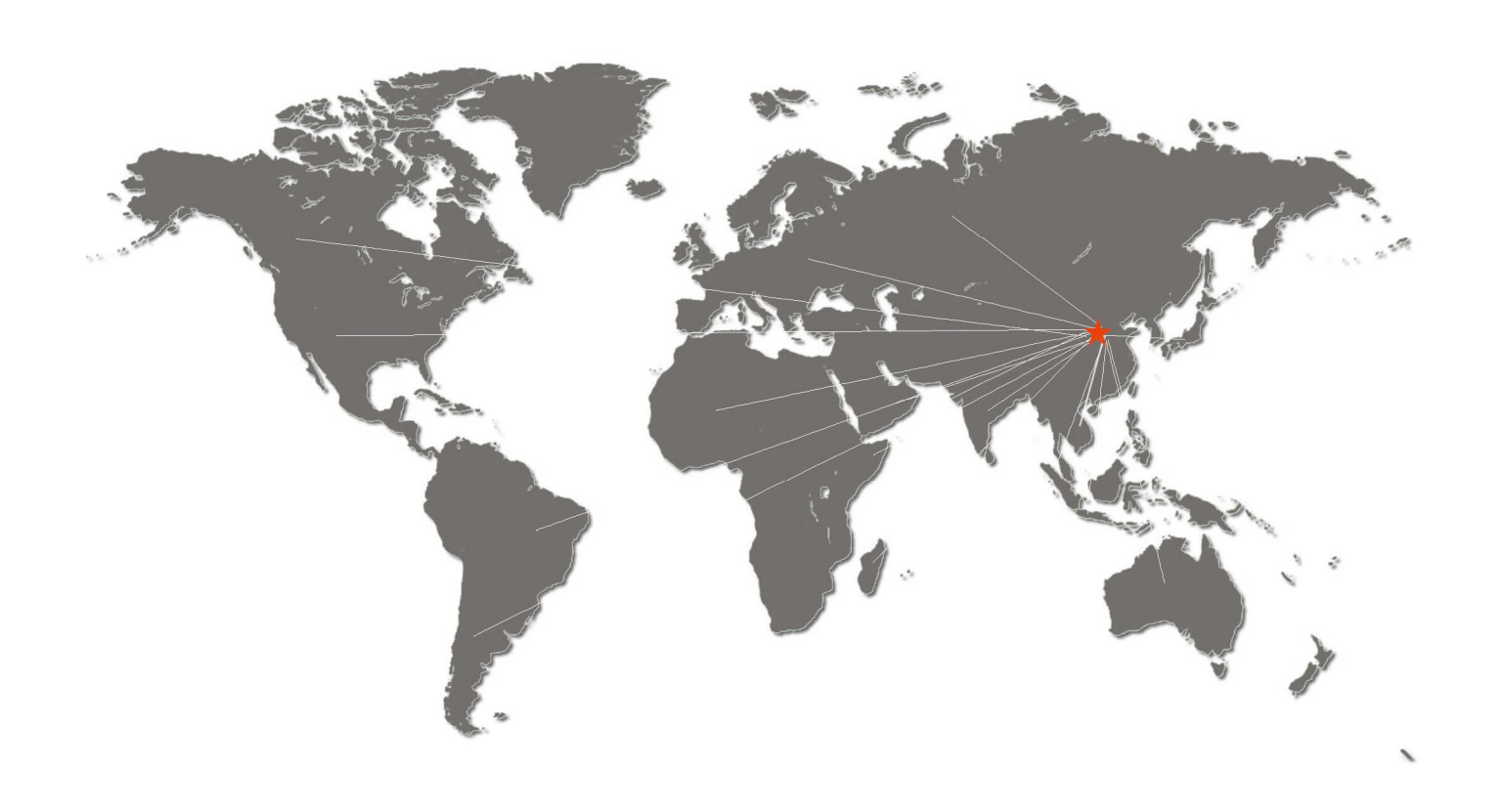
EXCT committed to be the best supplier in the world