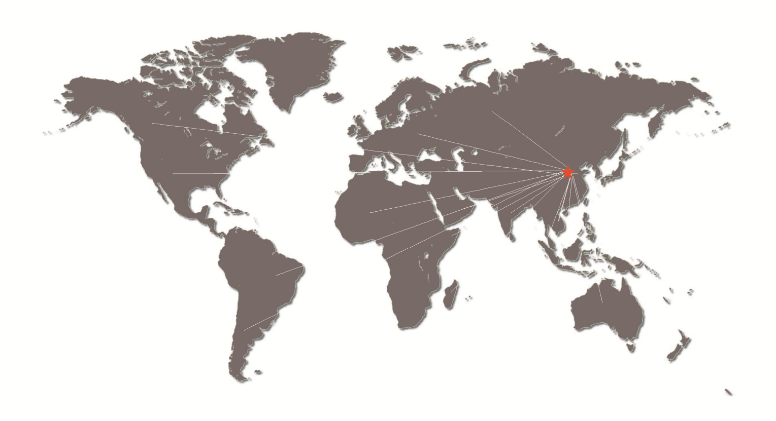
EXCT committed to be the best supplier in the world